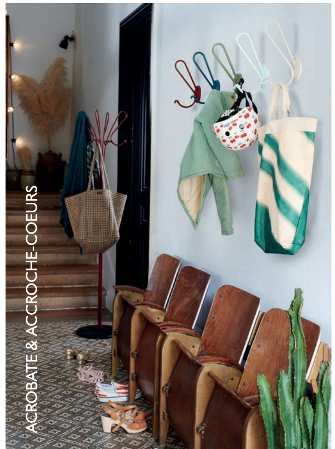
ACROBATE & ACCROCHE-COEURS